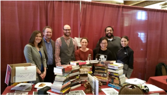
Faculty and Student Participants at the English Booth